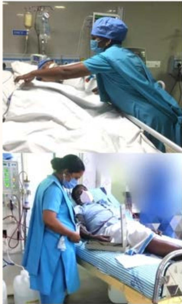
Our Nursing alumni working as nursing assistants at hospitals