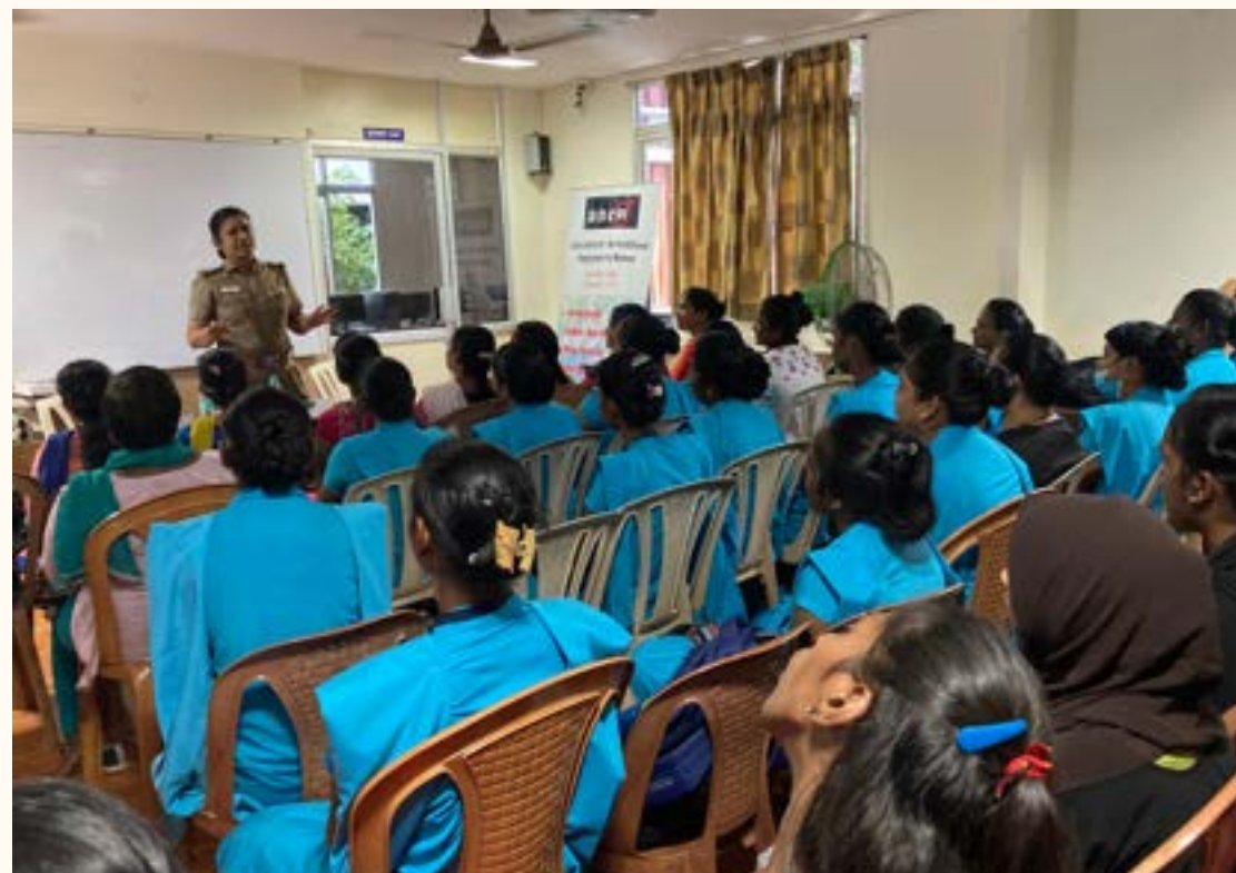
Session by Chennai police for students on the implications of theft and crime and how to deal with harassment at workplace