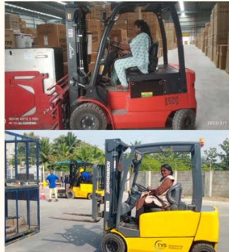
Being role models - our driving alumni working as forklift operators at TVS Logistics