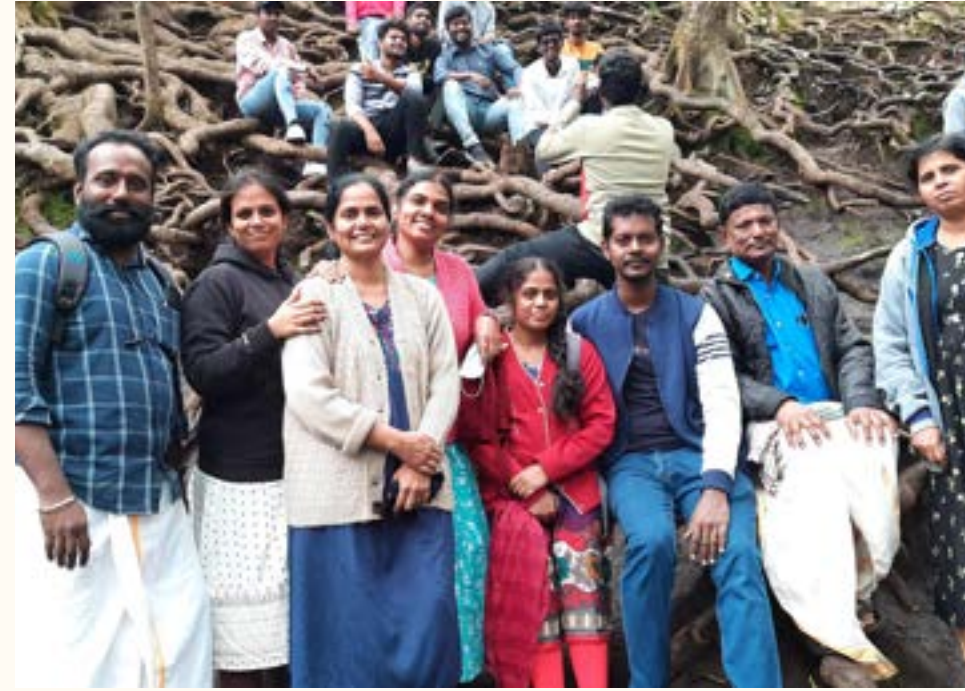
Annual Staff Trip