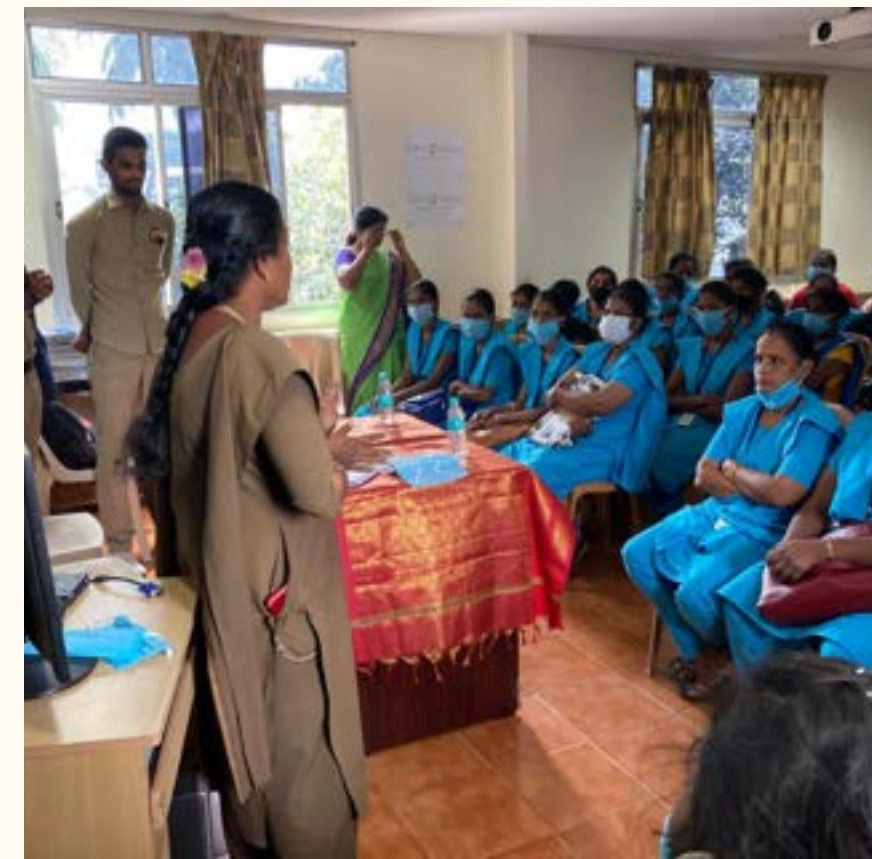
Staff from the Anna Nagar Post Office conducted a session on Financial Literacy for our Home Nursing students, with a focus on savings and various Post Office schemes.