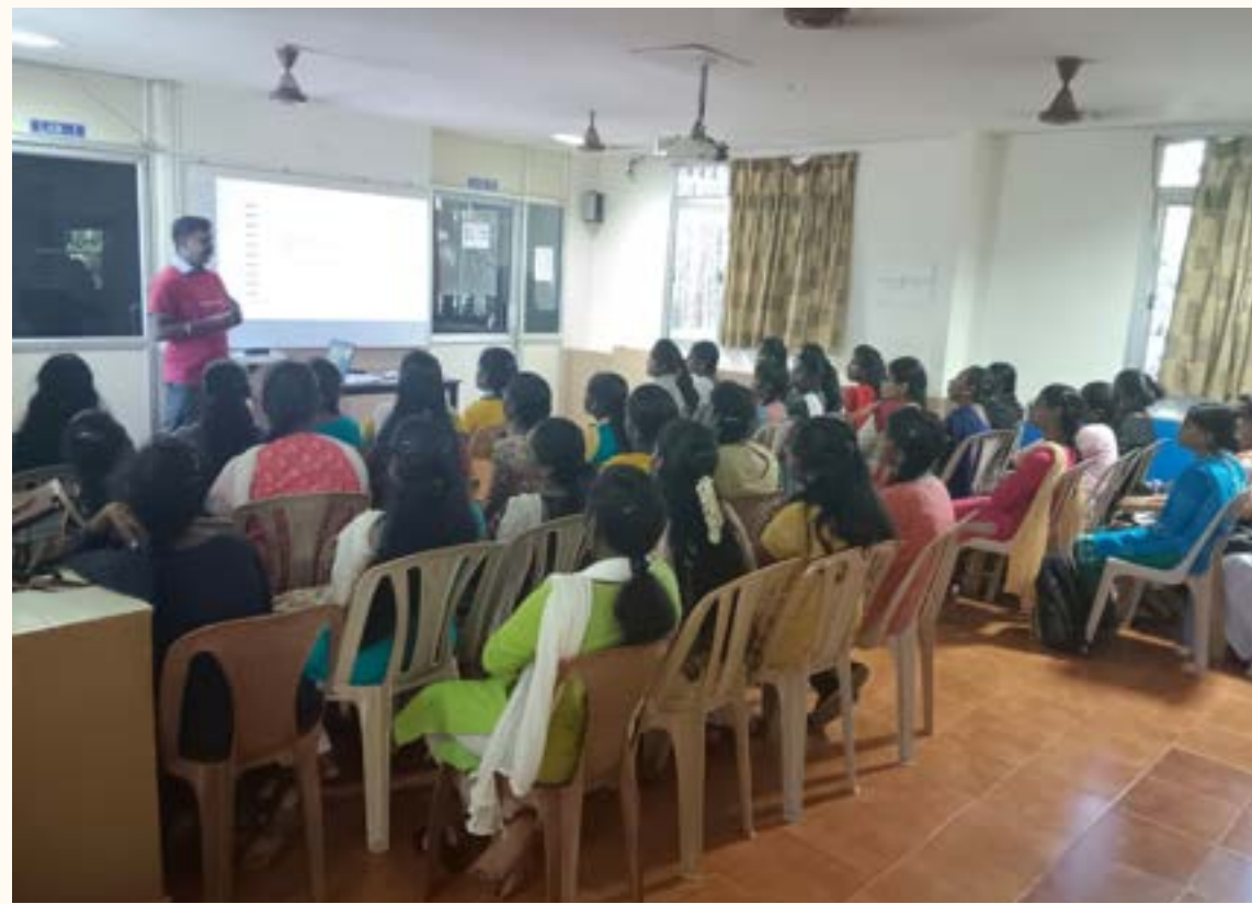
Staff from Bank of America conducted a session on Career Readiness for students, organized through Chennai Volunteers.