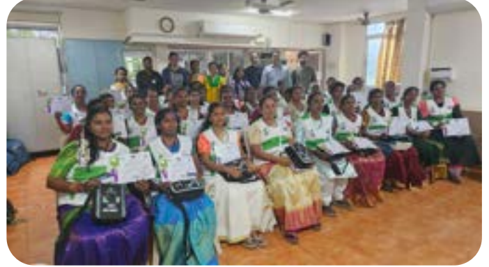
First Responders Training (First Aid & CPR) by ALERT NGO for 40 auto-driving beneficiaries in collaboration with Ford & SVP