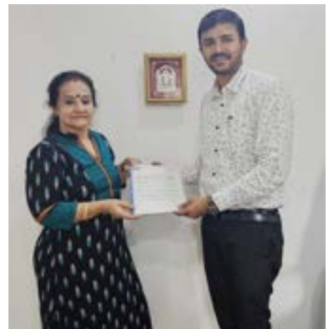
Thoripakkam - MOU signed with Tulips Multispeciality Hospital