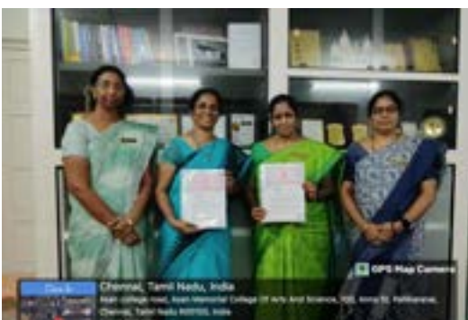
Thoraipakkam - MOU signed Asan College of Arts & College