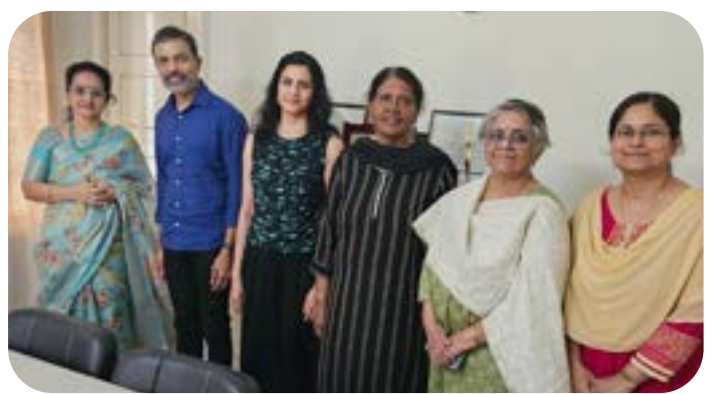
Due diligence visit by Collective Global Impact Foundation, USA