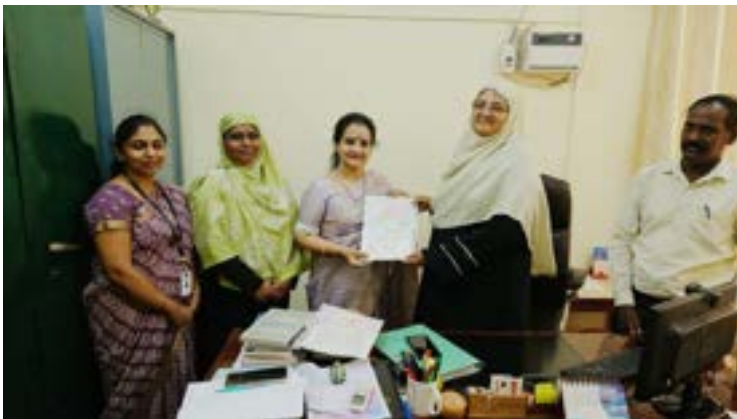
Thoraipakkam - MOU signed Quaid-e-Milleth College