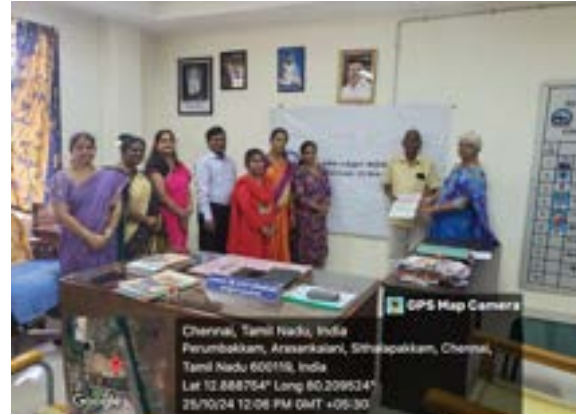
Thoraipakkam - MOU signed Government College of Arts & Science