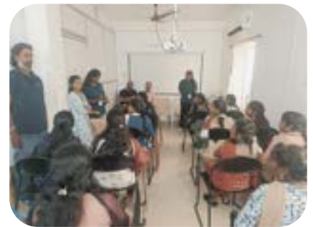
Career preparedness sessions by UST team at Anna Nagar & Thoraipakkam