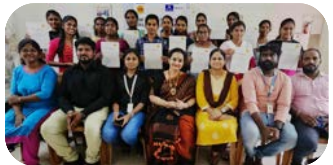
7 days soft skills & placement program by Magic Bus