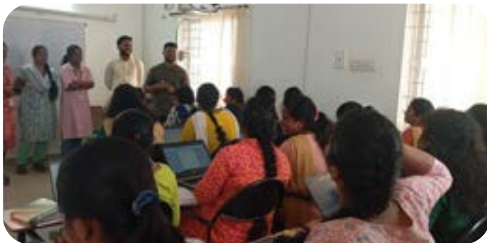
7 days soft skills & placement program by Magic Bus