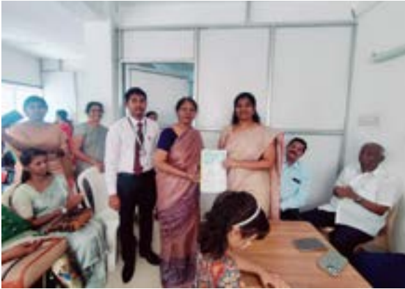
Thoraipakkam - MOU signed Mohamad Sathak College of Arts & Science