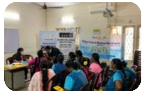
Cancer Screening program by medical professionals from Ramachandra Medical College, organised by Rotary Club of Madras North West for ANEW beneficiaries.