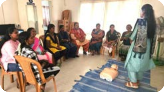
First Aid & CPR training for Driving beneficiaries conducted by TACT, sponsored by Inner Wheel Club of Madras Mid-town