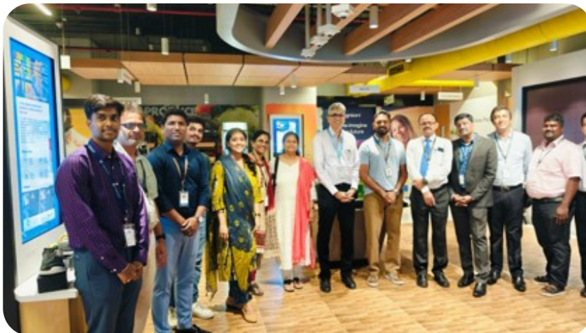
ANEW Senior Management members at the Cognizant Partners Meet

Our Senior IT Trainer invited to Seminar on Insights for Progress & Empowerment at Krishnaswamy College for Women