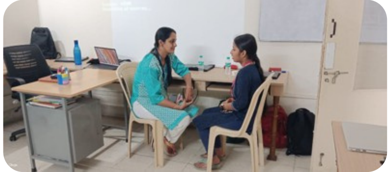
Career Readiness Workshop by FLEX team