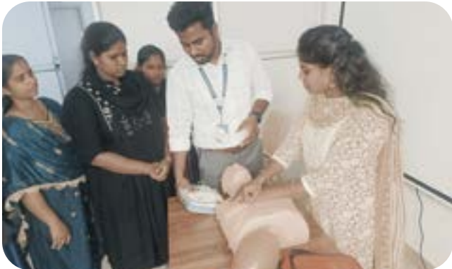
First Aid & CPR training for Thoraipakkam Home Nursing students conducted by TACT, sponsored by Rotary Club of Chennai Upscale