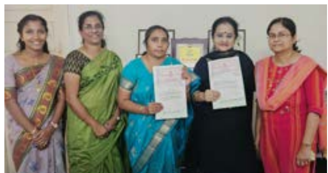
Anna Nagar - Revised MOU signed with Krishnaswamy College for Women