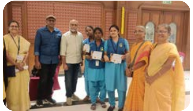
Cancer Awareness Workshop conducted by CANSTOP (SMF) attended by Home Nursing students