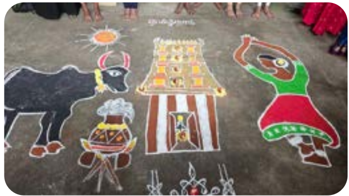
Pongal Celebrations at ANEW