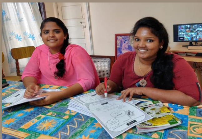
The American College, Madurai