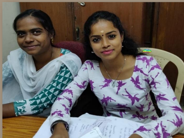
Soka Ikeda College for Women, Chennai